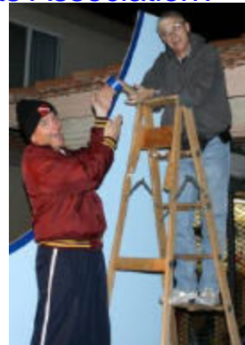
Who are these guys, and why do they look so happy??