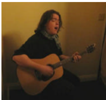
^^ We even had light music.. Metallica on classical guitar anybody?

"good stuff" because of the ethics rules. Too bad Congress can't obey the same ethics rules they impose on the rest of the nations servants and military.) In the end, everybody had a wonderful time. Soo—all you CH294 chapter members, be sure to make sure we have your current email addresses and keep an eye open for an invitation to next years event.