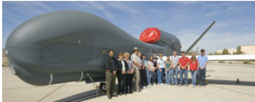
Size does matter!! Tonopah students up close and personal with the "Alien" end of a Block 30I Global Hawk. (Don't ask—We'd have to shoot you.)