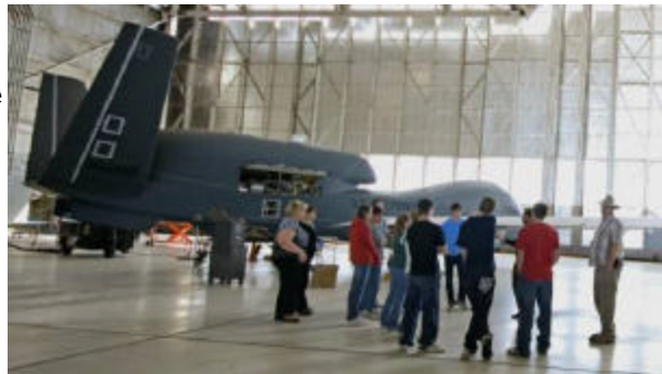
Tonopah students getting a closer look at the "innards" and power plant of the Global Hawk inside one of Edwards AFB's large hangars.